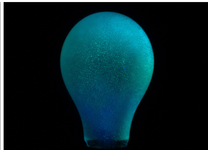
PAX-100 ELECTROSTATIC SPRAYER