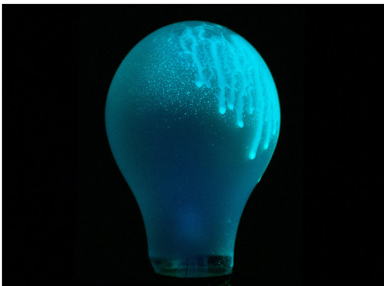
MANUAL SPRAY BOTTLE